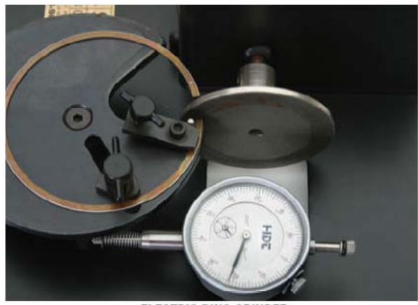
ELECTRIC RING GRINDER

Failure to remove all burrs and sharp edges could cause engine damage.